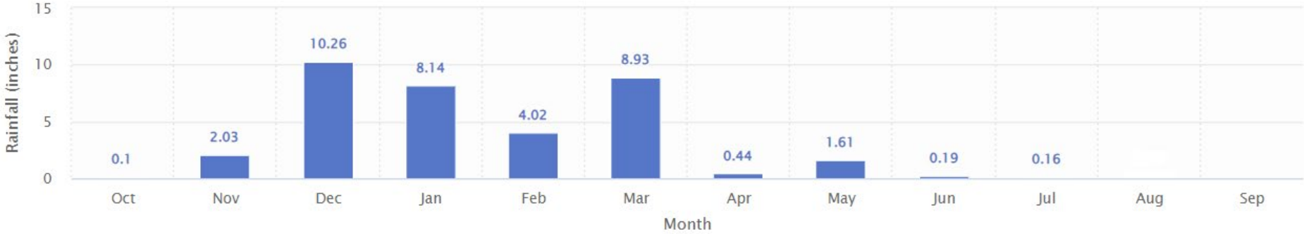
Monthly Rainfall for Current Water Year