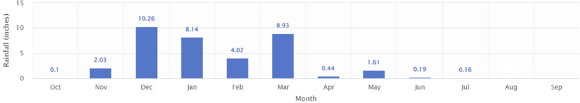
Monthly Rainfall for Current Water Year